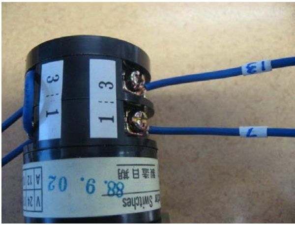
Wire 7 on pin 1 wire 13 on pin 3 keep switch front facing you!