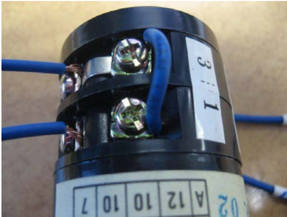
Left 3-1 have jumper, metal jumper 3 to 4 keep switch front facing you!